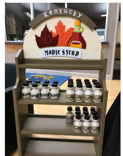
Kentucky Maple Day at Letcher County Extension

The Kentucky Maple Day Project had 1,893 visitors, 633 customers and 38 gallons of maple sold this year. The numbers of visitors, customers, sap collected and syrup produced has grown every year since Maple Day began.