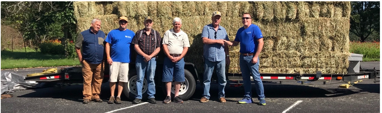
The office collected and distributed multiple loads of hay to help Letcher County farmers recover from the flood