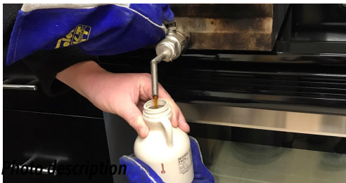
Bottling Maple Syrup