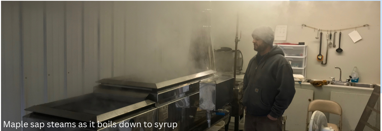
Maple sap steams as it boils down to syrup