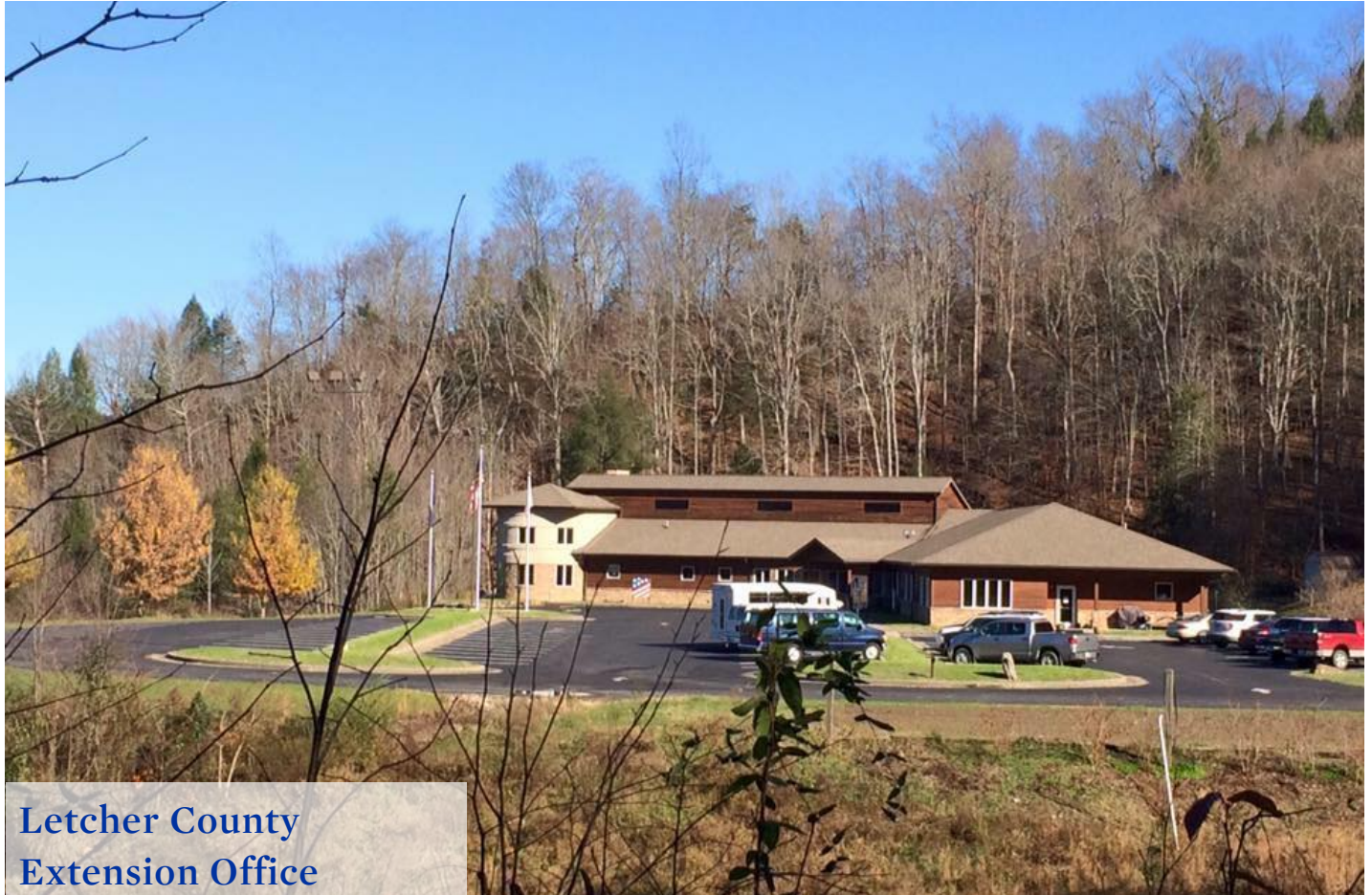
Letcher County Extension Office

Our county agents and staff work diligently to bring information and educational resources to members of our community.